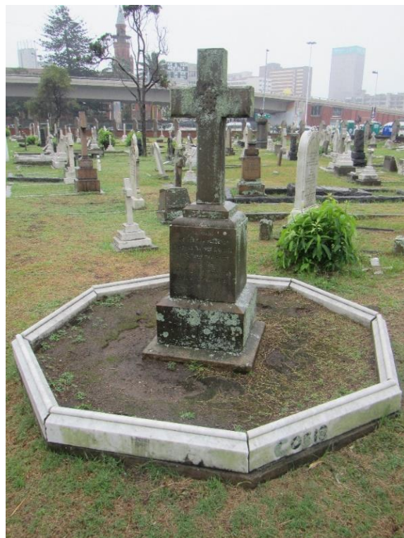
(Gravesite for Thomas Baines in the Old West Street Cemetery)

But nowadays sadly, much of Baines' extraordinary life as the King Lynn's adventurous traveller and pictureman, is forgotten in the city of Durban. His gravestone with its Latin cross and dark-green lichen growing at its base, has the inscription 'To mark the resting place of Thomas Baines FRGS. Artist and traveller who was born at Lynn Norfolk 1822. Died 1875'. The gravesite stands in its own octagonal solitude in the Old West Street Cemetery, enveloped by the cacophony from the adjacent taxi rank and showered by Durban's seasonal brilliant sunlight and shade.