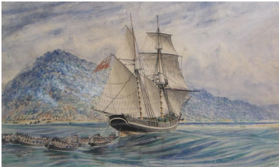
(From a sketch of an eye-witness account, the Thomas Baines painting of the Conch and trailing long-tail boats into the Bay of Natal)

Baines' paintings, drawings and sketches are his legacy contribution to contemporary South Africa for both the historical record they present and their artistic value. Some of his works can be found in Durban's Killie Campbell Africana Museum (the Campbell Collection has an August 1872 sketch of ships wrecked off the Durban coast) and in the Old Court House Museum, the well-known watercolour of the entrance of the Conch and trailing long-boats of British Redcoats into the Bay of Natal in June 1842 can be viewed.